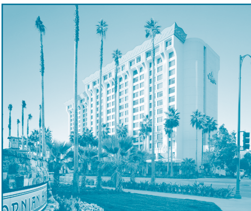
Disney's Paradise Pier® Hotel

Make your room reservation now! The special rate for the conference is $209. A limited number of rooms are reserved at this rate. To secure a room please contact the Disneyland® Resort by booking online 24/7 at https://www.mydisneygroup.com/gpoh18a or by calling (714) 520-5005, Monday-Friday from 8:00 am to 5:00 pm PST. Reservations must be made by Saturday, July 14, 2018 or before the group rooms are sold out, so do not delay. Prevailing rates may apply after this date or when the group rooms are sold out, whichever occurs first. Rooms are subject to availability.